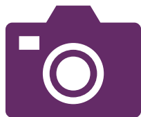
PHOTO BOOTH SPONSORSHIP - $1,000

Exclusive Sponsor of our Photo Booth with your Corporate logo on every photo taken by students and shared on social media platforms