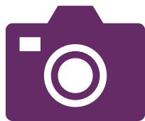
PHOTO BOOTH SPONSORSHIP - $1,000

Exclusive Sponsor of our Photo Booth with your Corporate logo on every photo taken by students and shared on social media platforms